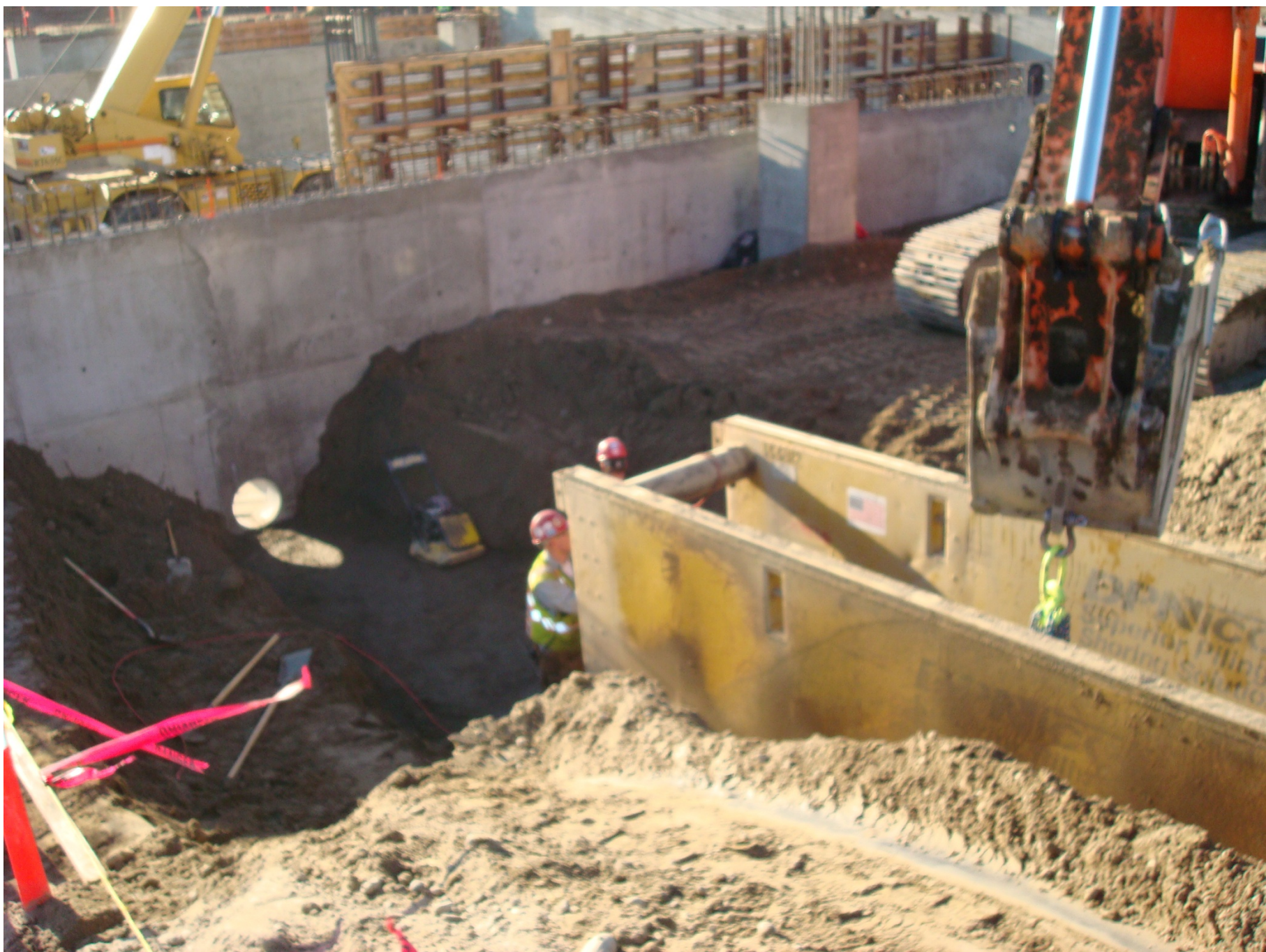
RCF Rain Leader Inlet to Detention Vault