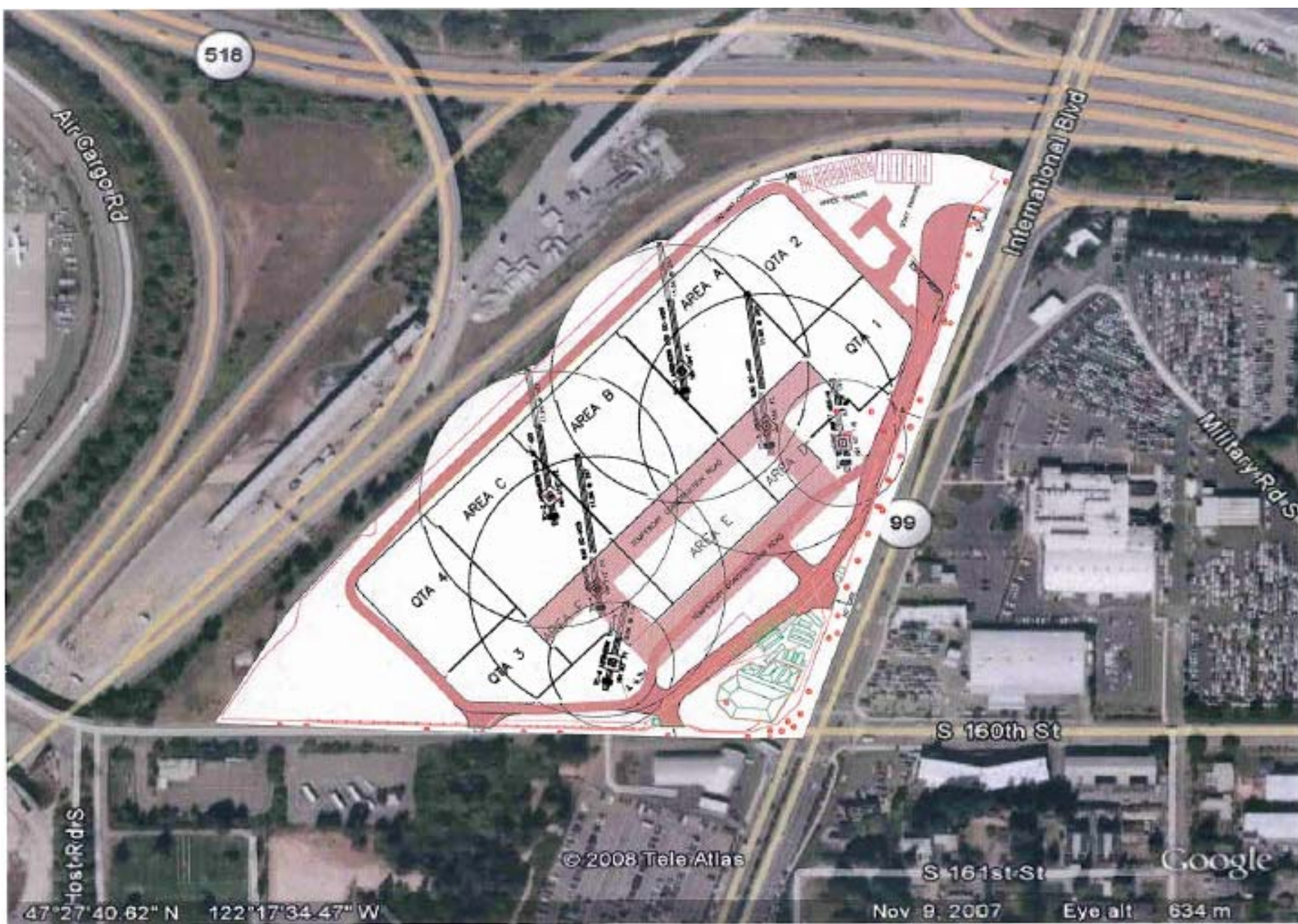
RCF Site Layout Plan