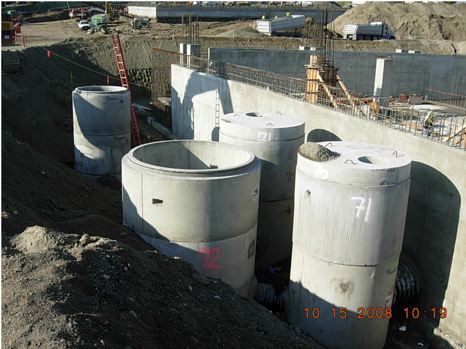
Detention Vault Flow Control Structure